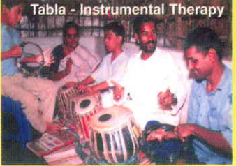
Tabla - Instrumental Therapy